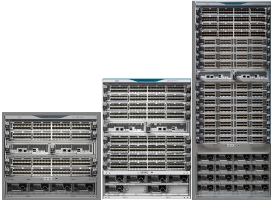
HPE Storage Director Switch C-series SN8700C